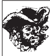
Long John Silver